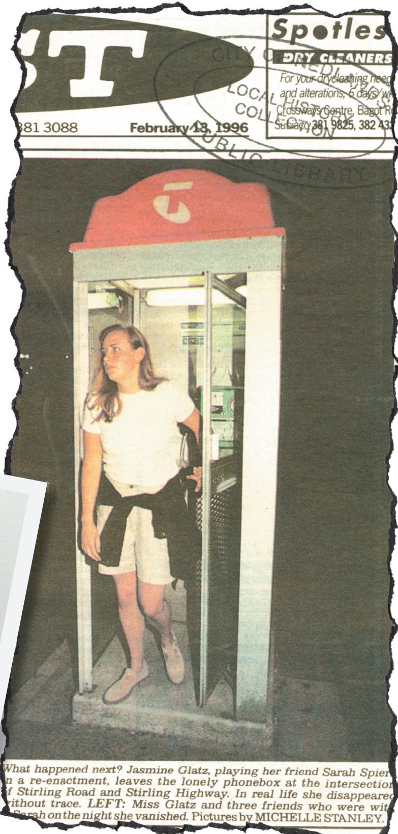
From the POST February 13, 1996. The POST photographed a friend of Sarah's who was dressed in identical clothes Sarah was wearing for a re-enactment at the same phone box in Stirling Road, Claremont.