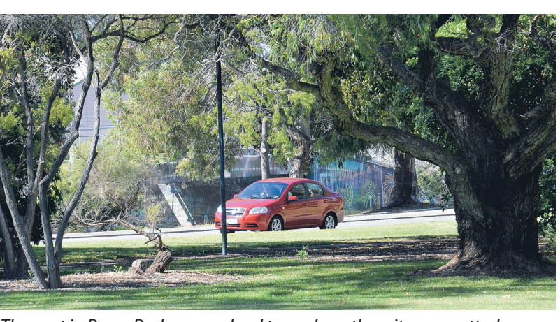
The spot in Rowe Park near a dead tree where the witness spotted a pervert in the weeks after a young woman was abducted from the park.