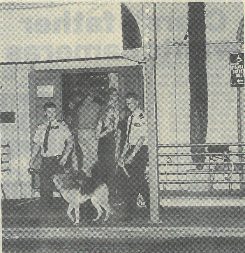
Security staff with dogs outside the hotel.

The taxi system installed by Club Bay View after Sarah Spiers disappeared was praised by police.