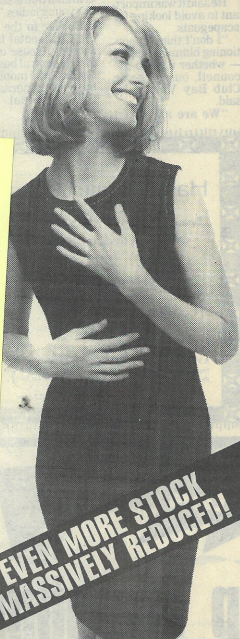
TABLE EIGHT MASSIVE FACTORY CLEARANCE