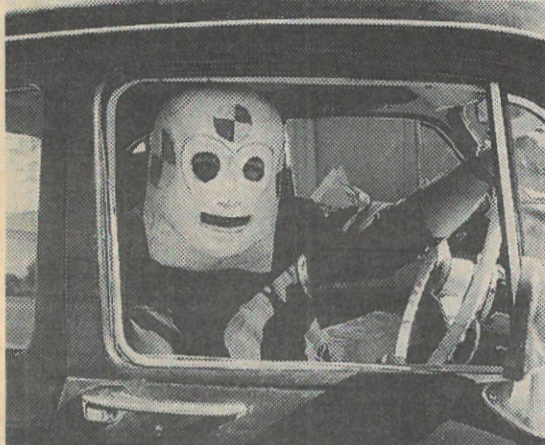
A glass-proof crash mask protects Rusty Haight as he prepares to crash a car into a pedestrian dummy.