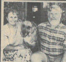
Subiaco's chaplain couple — PAGE 6